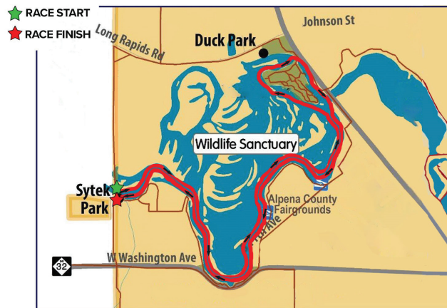
This year's kayak race course

The 2nd Annual “Reel Fun” Northland Challenge date has been officially released by Northland Area Federal Credit Union. On July 20th, 2024 from 9am-5pm, partnering with the Thunder Bay River Center and REEL FUN FISHING to sponsor a Single Kayak Sprint Race on the Thunder Bay River. In addition, there will be carnival games, and an arts and craft show at Duck Park. All proceeds will benefit the Thunder Bay River Center, Alpena Animal Control, and local Veteran groups. Event sponsorships are currently being accepted.