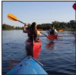
Kayak Race $2,250 in cash prize money