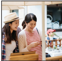
Arts & Crafts Vendors